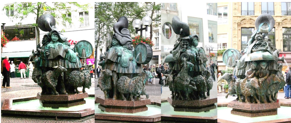
Fig. 1: Hämmelsmarsch (1982), by sculptor Wil Lofy, Luxembourg.

Thus, it also seems important to draw UNESCO's attention to the great Heritage, aesthetic and educational fortune of Urban Statuary.